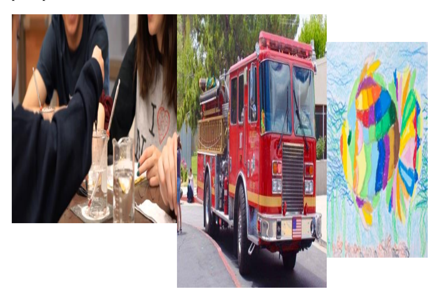
ONLY 300 Spaces Available: Kids' Program:

participate in fun outdoor activities and much more!